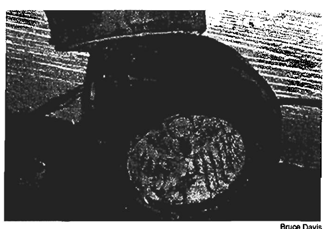
Clogged fan blades can result from duct leaks somewhere between filter and fan, severely limiting heat pump efficiency.

In new heat pump installations Proctor recommends that several strict criteria be employed. The measured air flow of the system should be between 5% below and 15% above the manufacturer's specification. The installed Energy Efficiency Ratio (EER)<sup>5</sup> or COP must be tested on site and be within 5% of specification. Duct leakage should be tested, and be less than 150 cfm at 50 Pa house pressure. Ductwork must be sealed at every joint with mastic tape. Coils and filters must be accessible for cleaning.